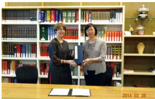
A replica of “Diamond Sutra” of the NCL collection is given to the NLA.

In addition, other holdings related to Christianity include 60 translations of the Bible, which are important in researching translation and Sino-interpretation issues. There are also many contemporary Chinese books and periodicals. The Australian government and academia have actively promoted Chinese studies: as such, since 1990 Australia has become an important academic center internationally, as well as an important partner in publication exchanges with the NCL.