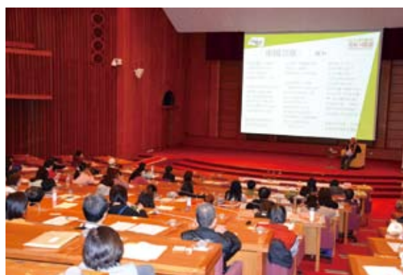
The lecture venue

The NCL reprised its “Four Seasons of Reading” lecture series this year, furthering the library’s ongoing efforts to promote national literacy. The spring series comprise seven lectures under the title “Reading the Poetry of Taiwan.” “Notable Figures of the Republic of China” is the main theme of the summer series, which brings together six lectures under the title “The Enlightened: Six Notable Figures from the Turn of the Century.” The fall lectures will put Chinese classics in the spotlight during a six-session series entitled, “Lyricism and Impressionism: Love and Alliance in Classical Opera.” The series will wrap up with six winter lectures on western classics.