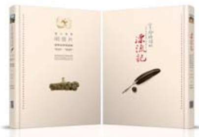
Published in January 2015