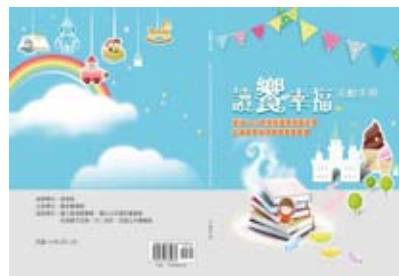
Published in February 2015