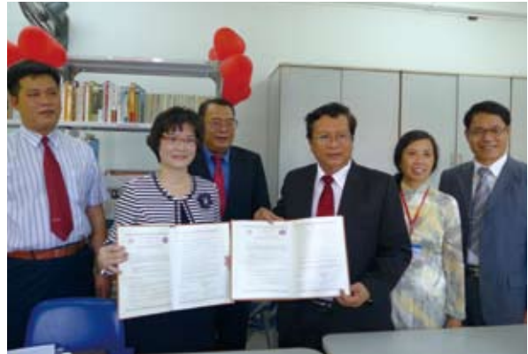
The TRCCS signing ceremony at the Ho Chi Minh City University of Social Sciences and Humanities.

overseas TRCCS branches and report related activities to further develop the role of the centers as an interactive platform in the Chinese studies community.