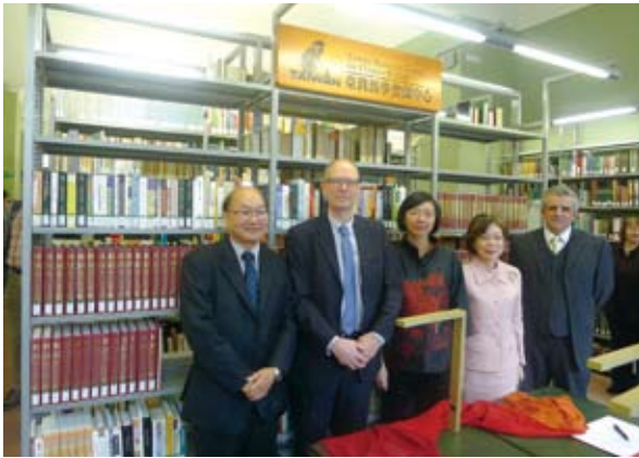
The TRCCS opening ceremony at the Leipzig University Library.

Universiti Tunku Abdul Rahman. An inauguration ceremony followed this signing, too.