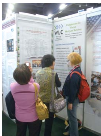
Visitors read in details the contents of posters and took picture for further reference

The 2012 Annual International Federation of Library Associations and Institutions (IFLA) General Conference and Council was held from August 11-17 in Helsinki, the capital of Finland. Among other activities, IFLA's poster session took place from August 13-14, which has attracted more than 300 conference participants. There were a total 195 pieces of posters presented and displayed from the countries of successful promotion of library and information services in five continents of the world.