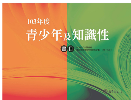
Published in November 2014