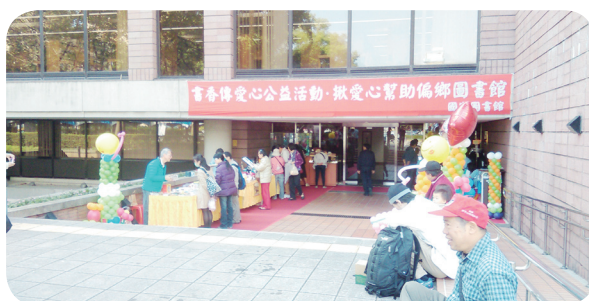
The Charity sale was held at the entrance of the NCL.

others. The activity raised NT$222,015 (US$6,900). All proceeds and donors are listed under News on the NCL's website. ( http://www.ncl.edu.tw/ct.asp?xItem=23028&ctNode=1620&mp=2 ) These proceeds were used to purchase illustrated children's books that received awards from Taipei Public Library and the Caldecott Medal of American Library Association. The books were then donated to seven remote elementary school libraries. Each school held a unique activity to thank the NCL for the donations, which enable their students to see a wider swath of the world through good books, as well as their own future.