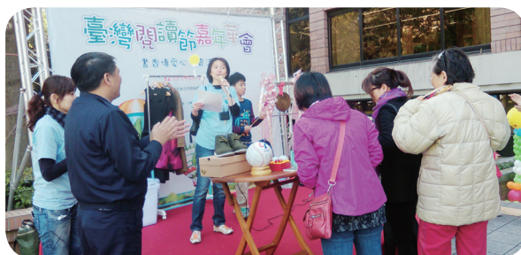
At a charity auction