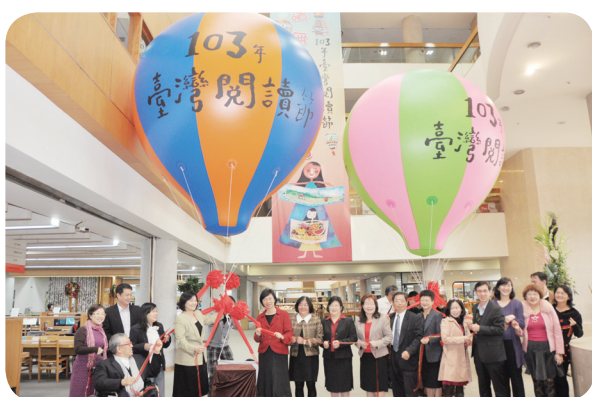
Honored guests and participants take a photo at the press conference.