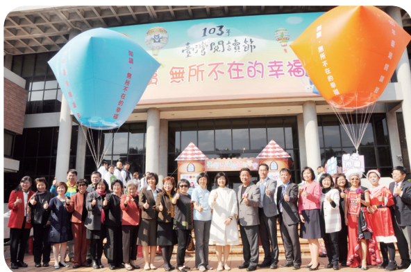
Honored guests and participants take a photo during the opening ceremony.