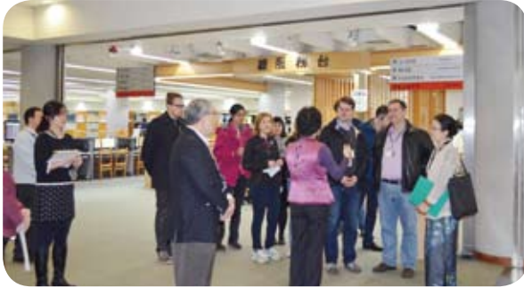
Explaining holdings and services at the NCL

understanding of the richness of research materials in Taiwan and were happy to have an opportunity to interact with scholars from other countries.