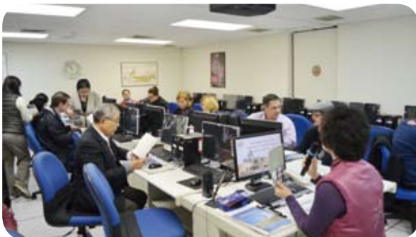
A look at important information systems at the NCL