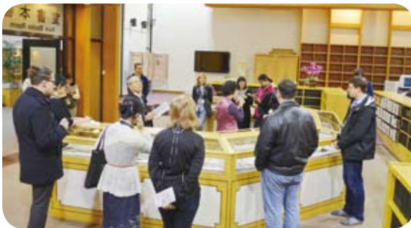
Scholars visiting the rare books room and the manuscript exhibition of celebrities from late Qing and early Republic.