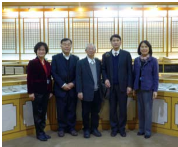
A group photo taken in the Rare Books Room