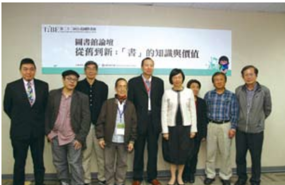
Speakers at the library forum

Special Collections Division, spoke on the ancient books in their collection and NCL's rules for and examples of borrowing NCL's ancient books to print republications. He also invited the publishing industry to do more to increase the circulation of ancient texts and helped the public better understand what books are in NCL's collection.