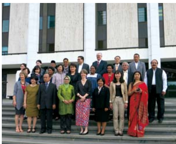
A group photo of conference attendees

of Australia. In all 28 representatives attended from 20 different countries, including Australia, Brunei, Cook Islands, Fiji, India, Indonesia, Japan, Korea, Malaysia, Myanmar, New Zealand, Papua New Guinea, the Philippines, Singapore, Taiwan, Thailand, Timor-Leste, Vanuatu, Vietnam. NCL Director General Tseng represented Taiwan at the meeting.