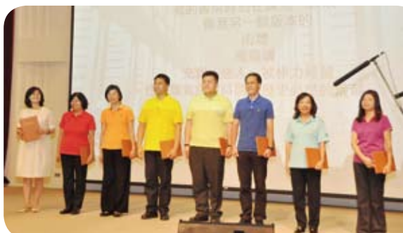
Poetry Chanting and Singing