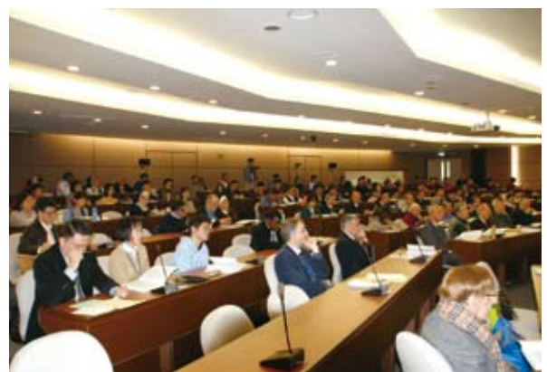
The conference venue

In a speech presented at the opening ceremony, NCL Director General Tseng observed that the cooperation between the Chinese studies centers of the NCL and FJU has continued since the launch of the first FJU International Sinological Symposium in September 2003. The two sides are both committed to promoting domestic and foreign academic activities and exchanges. They also cooperate closely in a shared mission to promote Sinological research in Taiwan and abroad.