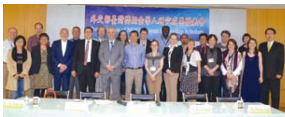
The CCS holds first round of research presentations

a doctoral candidate from the University of Nottingham in England, who spoke on “Taiwan’s Unbalanced Response to China’s Military Threat.” He analyzed Taiwan’s policies that address China’s military threat and made some adjustments to the traditional military theory that applies the quantitative research. The symposium was attended by 32 scholars from 17 countries and corresponding diplomats, as well as officials from the Ministry of Education, scholars, reporters, and the general public. In all, approximately 110 people were in attendance.