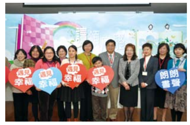
Honored guests, participants and NCL's staff taking a photo in the event venue.

The bibliographies have been provided to public libraries nationwide as references for book purchasing. The NCL is also expanding cooperation ties with the publishing industry, cultural and educational organizations, and libraries at all levels to build momentum for universal literacy.