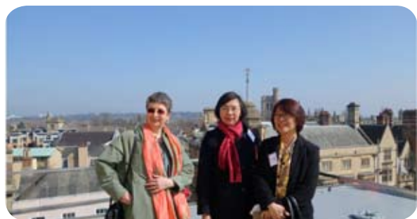
Director General Tseng and ceremony attendees see the spectacular scenery around the Oxford city from the roof of the Weston Library.

Oxford also arranged a guided tour of the Queen’s College Library, the Old Bodleian Quadrangle, Divinity School and Duke Humfrey’s Library, as well as a display of a selection of Chinese Special Collections in the Conservation Studio of the Weston Library. Participants were impressed with Oxford’s historical architecture and rich collection.