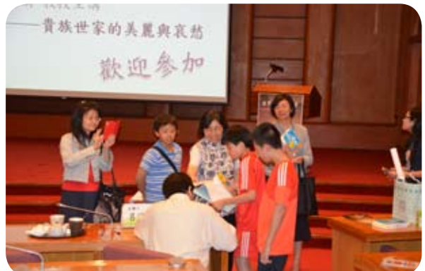
Book signings by the lecturers