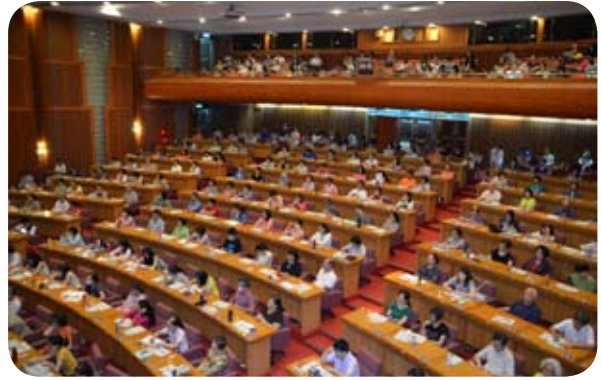
Each lecture is filled to capacity.