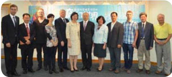
Group photo at the opening ceremony

schools, parents to bring their children to come and give the child a different art experience, to read together the fairy tale from other parts of the world, and to come in contact with different cultures.