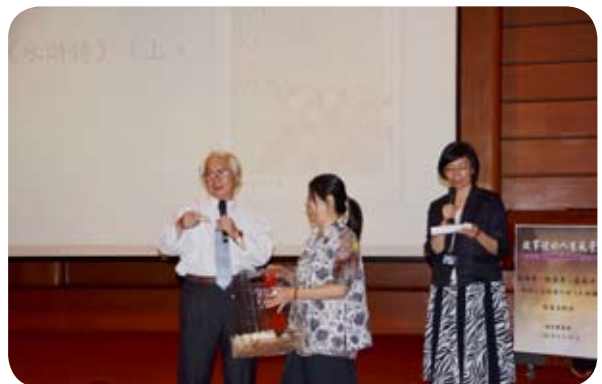
Raffles are held after the lectures.