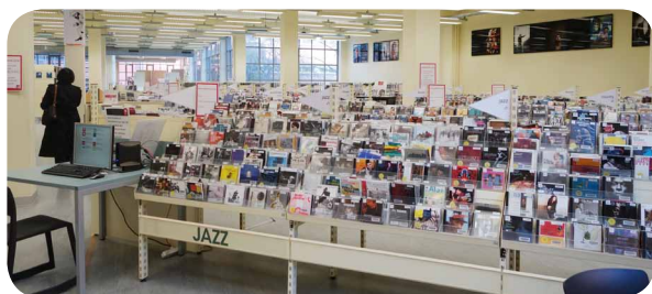
The audiovisual area at the BT.

She visited audiovisual area, reading halls, children's area and other facilities, as well as children's books illustrators' exhibition at the BT. During her visit, the BT was holding the movie "Star Wars" exhibition. The exhibition expenses are provided by the Star Wars Fan Club, the BT has only to assume insurance expenses. This practice not only enhances the promotion of the community participation in librarianship, improving library utilization of readers, it can also help to save in operating expenses, create news topics, so that more people become aware of the new features of the library. This practice is worth learning.