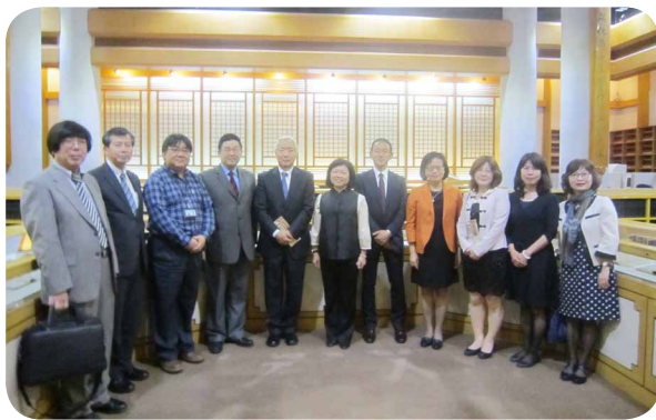
A group photo taken at the Rare Books Room.