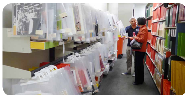
AIATSIS possession of a number of works of art and paintings.

AIATSIS collects Australian Aboriginal and Torres Strait Islander related audio-visual materials, photographs, drawings, artwork, and preserve them through digital scanning. AIATSIS usually holds multicultural educational activities. It is also engaged in related academic research as well as offers scholarly studies incentives. It has a publishing house, and actively carries out language preservation, collects materials and engages in multicultural education.