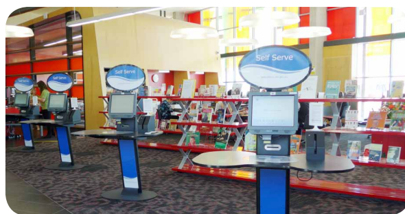
A number of self-service machines displayed at the Gungahlin Library.

and its interior design have bright colors and well lighted. The lighting design of the children's area, the youth animated area, the bookshelves design, the directions, the tables and chairs of the discussion area are also all very bright. Altogether they give a lively, relaxed feeling.