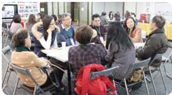
Participants discuss in small groups.