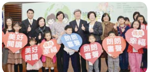
Group photo taken after the press conference.

Education Minister Wu present at the press conference affirmed all the lending and reading model. He noted that public libraries have improved their library space in recent years and their respective collections increased as well. He encouraged the general public to make greater and better use of library facilities.