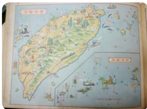
A map of Taiwan's diverse industries.