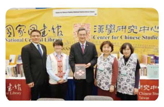
NCL staff and representatives of book donation recipients at the AAS Book Fair.

Besides allowing scholars from around the world to browse through the books and materials exhibited and make orders as well, after the conference, the books exhibited were donated to the University of Washington and the University of Oregon to enrich their respective library collections, providing local researchers with related resource materials.