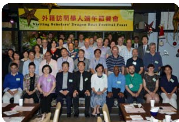
The NCL and MOFA colleagues with visiting scholars.

This was an occasion for scholars to have a better understanding of each other and to exchange and share experiences of their research and life in Taiwan.