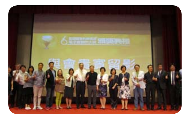
Group photo of honored guests of the event.