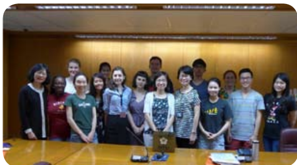
Group photo taken in the NCL meeting room.