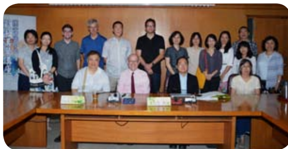
Group photo of presenters and participants.

Many of the participants of the lecture that day were Taiwan experts and scholars of Ming Dynasty history. The discussions that followed were filled with enthusiasm and pleasant participation.