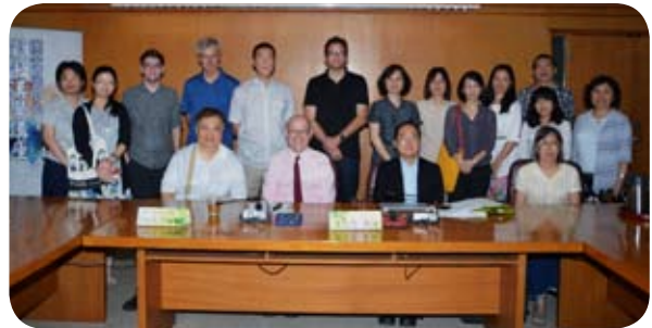
Group photo of presenters and participants.

Many of the participants of the lecture that day were Taiwan experts and scholars of Ming Dynasty history. The discussions that followed were filled with enthusiasm and pleasant participation.