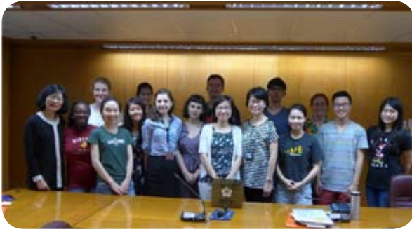
Group photo taken in the NCL meeting room.