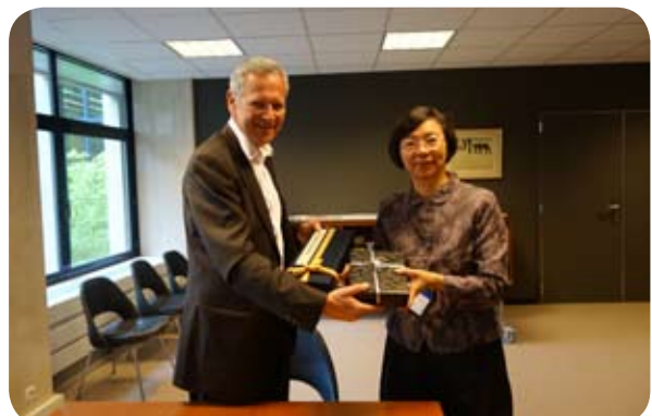
Commemorative gift exchange.