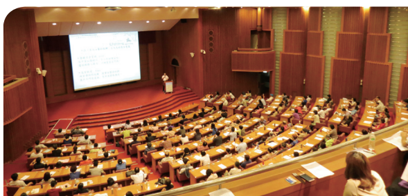
Participants watch the BAB film.

From then until Sep. 13, this illustration contest will be hosted by 9 major institutions in different areas of Taiwan. There will be 10 superior and 20 excellent rating works selected to join the exhibition of 2016 Biennial of Animation Bratislava in Slovak.