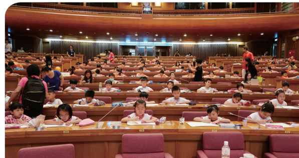
Drawing contest in progress.