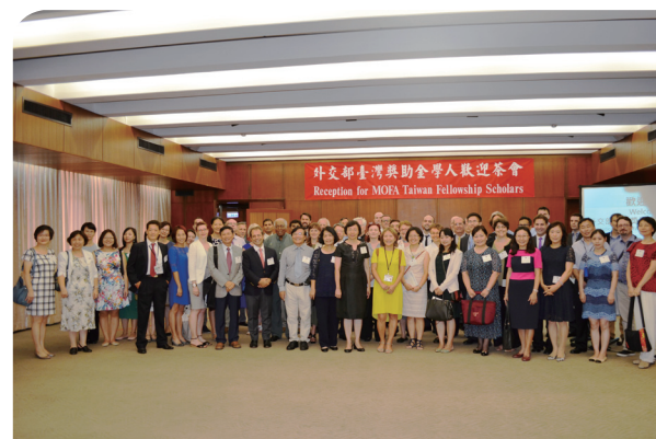
A group photo of all the 2016 Taiwan Fellowship recipients.