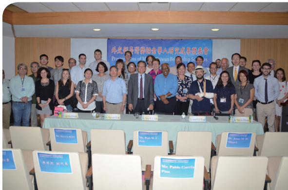
A group photo of presenters and participants.

public. After the presentations, the session was opened up for questions. The discussion, as intense as it was, centered on international relations and Taiwan's policies. Many views were exchanged.