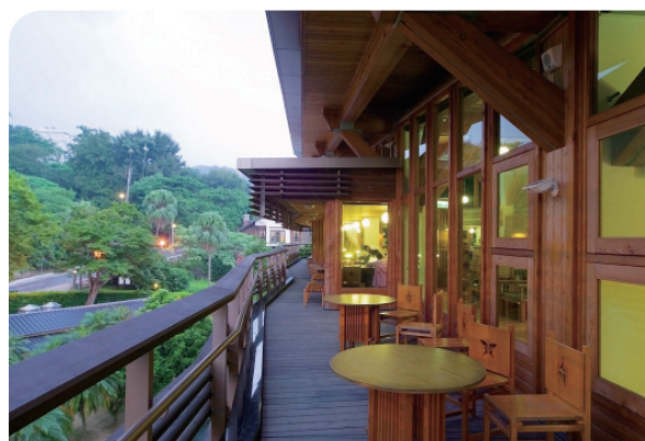
A mixed atmosphere of nature and building.

edifice (one underground) has a total area of 2,150 sq. m.. The roof is equipped with solar panels, which provide a portion of the energy needs of the library. Its architectural designed earned it a spot on the "25 Most Beautiful Libraries in the World" list in 2012 by Flavorwire.com.