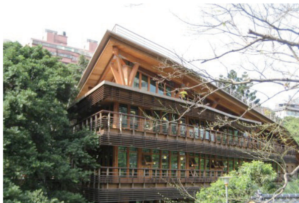
Photo of the Beitou branch library.

provide optimal lighting but also allow patrons to enjoy the natural scenery outside. The library is constructed primarily of wood so that library visits feel like a trip to the forest.