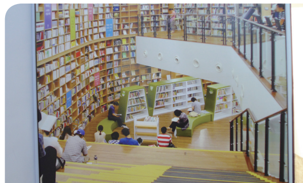
One of the reading areas of the Seoul Metropolitan Library.