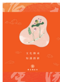
Published in Aug. 2016 ISBN: 978-957-678-620-4

The NCL has a new version of its Chinese-language guide this year, which discusses its aims, strategies, service facilities, and other new information.