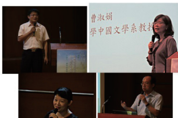
Speakers of the Fall Lectures Series.

The format gives a comprehensive overview of cultural images in the classics. Four of the lectures have already transpired, namely “Between Mountain Forests and Officialdom: Tang Scholars’ Travel Descriptions” (Aug. 27), “The Imagination and Construction in Records of Late Ming Gardens” (Sep. 3), “The Travel Fad and Travel Descriptions by Ming and Qing Literati” (Sep. 10), and “The Material Culture of Overseas Travelogues in the Late Qing” (Sep. 24).