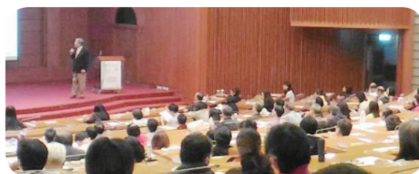
Attendees fill up the lecture venue.

To promote reading, the main focus of the winter lecture series was on popular new thinking and trends in management studies.