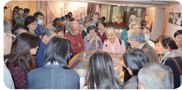
A special exhibition on Mr. Wei-shui Chiang held in conjunction with the forum at the NCL.

Chiang presented his diagnosis of the problems facing Taiwanese society. To commemorate it, the NCL and related institutions jointly hosted a special exhibition on Mr. Chiang (from Nov.8 to Dec. 25) and the “Knowledge Nutrition and Cultural Power: A Forum on the 95th Anniversary of Wei-shui Chiang’s ‘Clinical Notes on Knowledge.’”