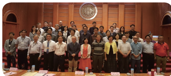
Speakers and guests attending the event at the NCL.

During the event, the various e-book platforms were invited to share their experiences of digital publishing in Taiwan, introduce their platform's functions and services, and describe their e-book sales methods. This provided them with an opportunity to understand each other's digital publishing solutions, which will then spark new ways of cooperation within the publishing industry, enable those in the industry to get to know each other better, and construct ever more refined digital reading methods.