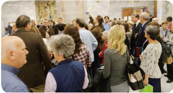
The Exhibition is filled to capacity.

expressed gratitude for the widespread support for both the exhibition and the lecture. They hoped that cultural exchange between the two countries can continue, and that future collaboration can become more frequent and achieve a greater depth.