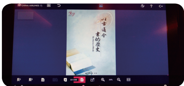
Access to NCL's e-books on China Airline flights.

Travelers are encouraged to give the books a try. This collaboration between NCL and China Airlines marks a new path in efforts to increase reading habits.