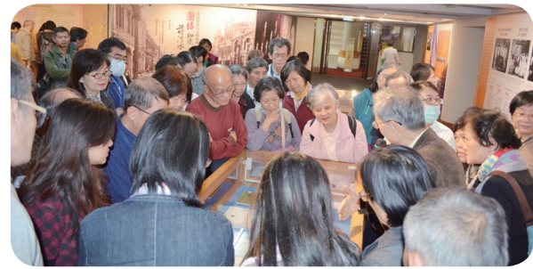
A special exhibition on Mr. Wei-shui Chiang held in conjunction with the forum at the NCL.

Chiang presented his diagnosis of the problems facing Taiwanese society. To commemorate it, the NCL and related institutions jointly hosted a special exhibition on Mr. Chiang (from Nov.8 to Dec. 25) and the “Knowledge Nutrition and Cultural Power: A Forum on the 95th Anniversary of Wei-shui Chiang’s ‘Clinical Notes on Knowledge.’”