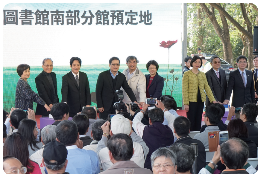
Premier Lin (2nd left) visits the proposed side of NCL's southern branch and union archive center.

Premier Lin pointed out that by building a southern branch of NCL he hopes reading resources can be better allocated throughout the island. Furthermore, he anticipates that the branch will