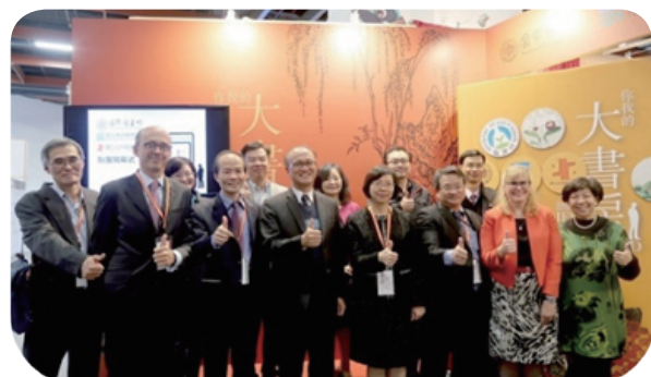
All dignitaries attending the opening ceremonies pose in front of the "Libraries: The Wonderland."

The 2017 Taipei International Book Exhibition (TiBE) ran from February 8-13 at the Taipei World Trade Center's exhibition hall. National Central Library used this yearly exhibition to share its abundant resources with both Taiwanese and foreign readers. This year, NCL also invited National Taiwan Library and National Library of Public Information to join in a joint exhibition entitled "Libraries: The Wonderland."