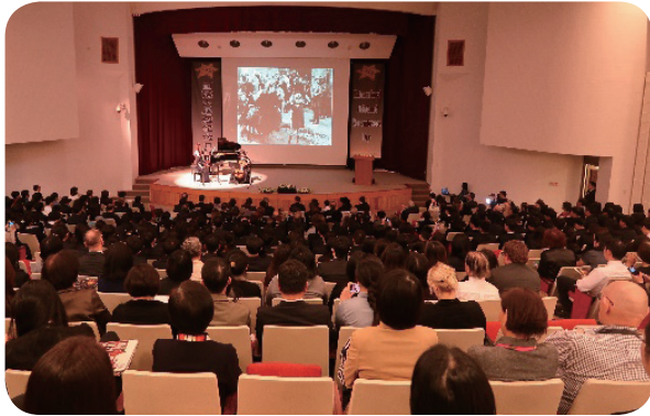
During the event music composed by Jewish composers is played.

Jewish musicians. The movie “Holocaust” was also played.