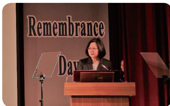
President Ing-wen Tsai attends and speaks at the event.