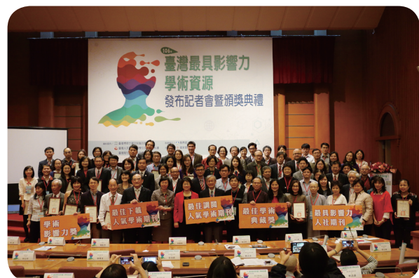
All award winners pose with honored guests.