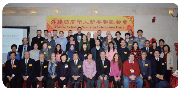
Group photo of all visiting scholars present.

On February 13, the Center for Chinese Studies held a New Year Celebration Party for its visiting foreign scholars. All current recipients of the Center's Research Grant for Foreign Scholars in Chinese Studies and the Ministry of Foreign Affairs's (MOFA) Taiwan Fellowship were invited to attend. In all there were 39 scholars and their families from 23 different countries.