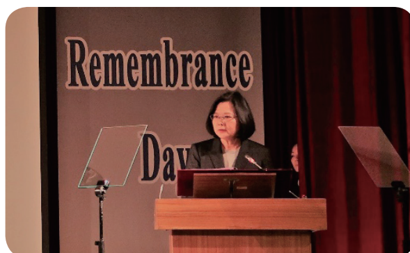
President Ing-wen Tsai attends and speaks at the event.