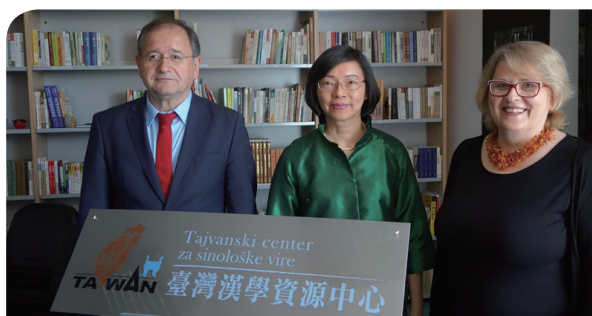
The University of Ljubljana unveils the sign for its Taiwan Resource Center for Chinese Studies.