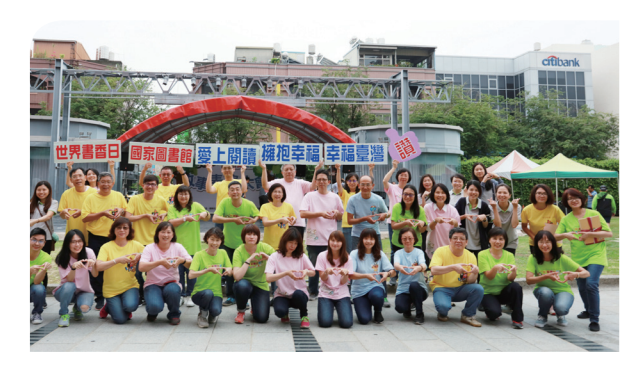
The NCL flash mob was joined by a group from the Tainan Public Library to sing at the final performance in the relay.