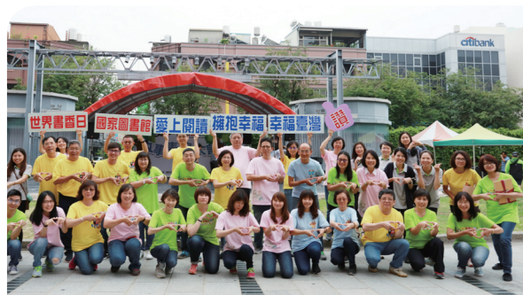
The NCL flash mob was joined by a group from the Tainan Public Library to sing at the final performance in the relay.