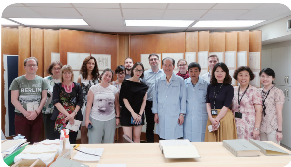
The delegation visits NCL's restoration room.