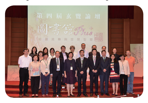
A group photo of experts and scholars from China and Taiwan at the 4th Xuanlan Forum.

Starting in 2012, the NCL and the Nanjing Library determined to host a Xuanlan (玄覽) Forum each year. 2017 was the fourth year, with the forum being hosted by the NCL on Oct. 17. The theme for this year was "Library Plus: Knowledge Flow and Space Creation." A total of thirteen scholars and experts from the Nanjing Library, the National Library of China, and from Taiwan were invited to speak on five issues under the following two broad topics: "Library Plus: Removing Wall and the New Face of Libraries, Cross-industry Collaboration and New Services Routes" and "Knowledge Plus: Bringing New Life to Ancient Books and Knowledge Restructuring, Digital Humanities and Knowledge Sharing, Cloud Learning and the New Face of Reading."