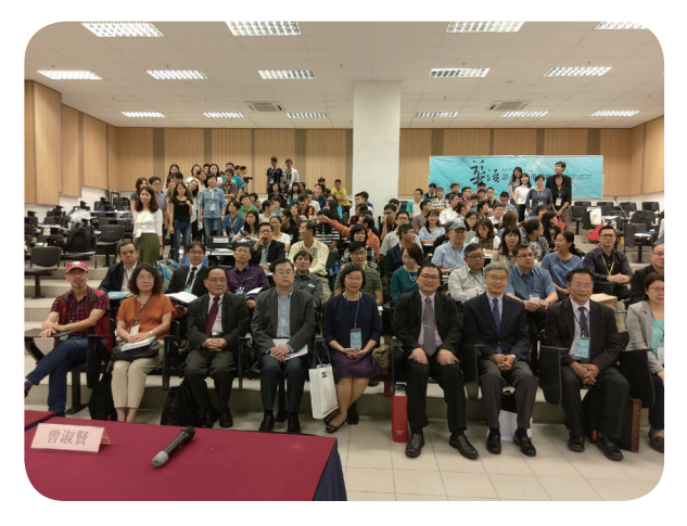
Distinguished guests gather for a group photograph at the International Conference on the Sinophone and Writing Southeast Asia.

a lecture there on Nov. 23, on the topic of Taiwan Literature and World Literature.