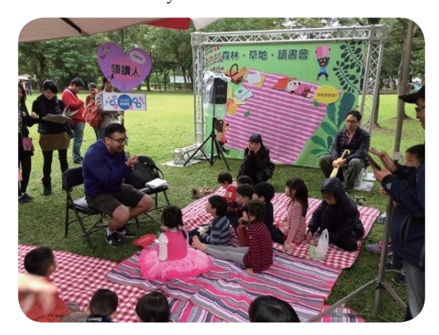
Forests, Grass Fields, and Reading Groups attracts a lot of children.

Other activities included Forests, Grass Fields, and Reading Groups; Reading 101; I Choose My Reading Style; and Love You Library: Missions for Librarians for a Day.