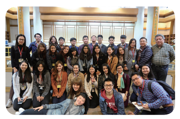
Group photo at the Rare Books Room of the NCL.

video. They also visited Digitization Center, Rare Books Room, as well as other service facilities of the NCL.