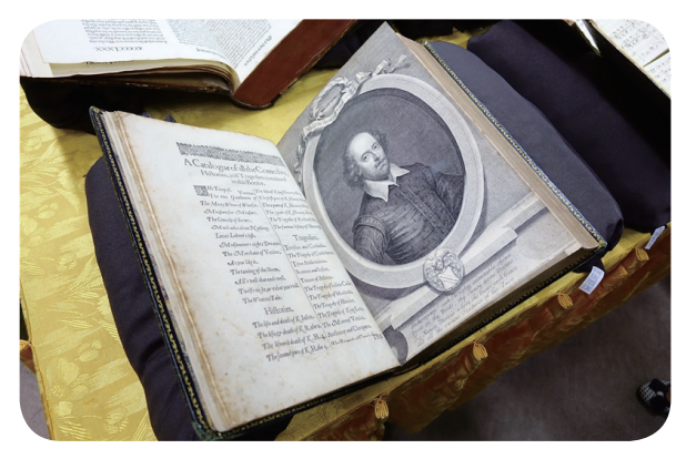
The deposited books include Shakespeare's Second Folio.

There are more than 4,400 volumes NCL's Western language collection that are more than a century old. In future the Library will scan these books and put them online, so that readers can conveniently browse them or use them for research.