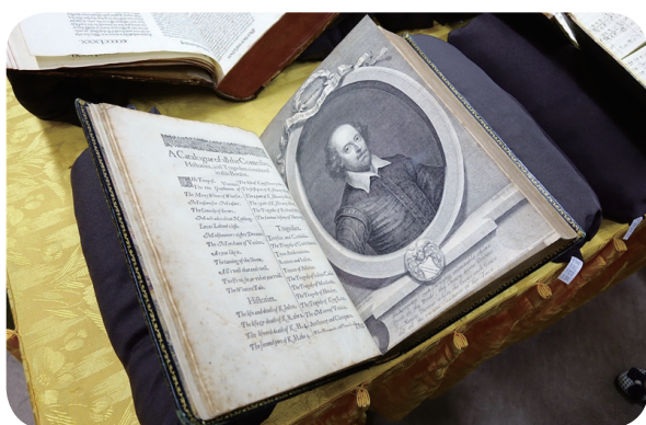
The deposited books include Shakespeare's Second Folio .

There are more than 4,400 volumes NCL's Western language collection that are more than a century old. In future the Library will scan these books and put them online, so that readers can conveniently browse them or use them for research.