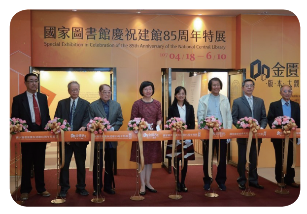
NCL Director-General Tseng (4th right) with other dignitaries.

The exhibition "Imperial Repository 85: A Showplace of Unique Versions" had on display classical works held at NCL and well-known by the public, such as Hamlet, The Old Man and the Sea, The Tale of Genji, The Dream of the Red Chamber, and Taipei People ...etc. Specifically, various versions of these works were showcased for public viewing. Through explaining the story behind the differences in each version, the quality and quantity of NCL's holdings, its unique role as Taiwan's legal deposit repository, and its belief in book preservation and knowledge heritage were readily apparent.