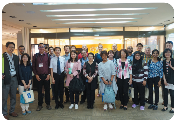
Foreign scholars visit the National Archives Administration.

Every year, the National Central Library (NCL) organizes a one-day program of activities familiarizing visiting scholars with Taiwan’s academic resources and explaining how to utilize them. The first program of 2019 took place on April 11. In the morning, scholars attended a session on using the resources available at the library. This was followed by an afternoon visit to the National Archives Administration (NAA).