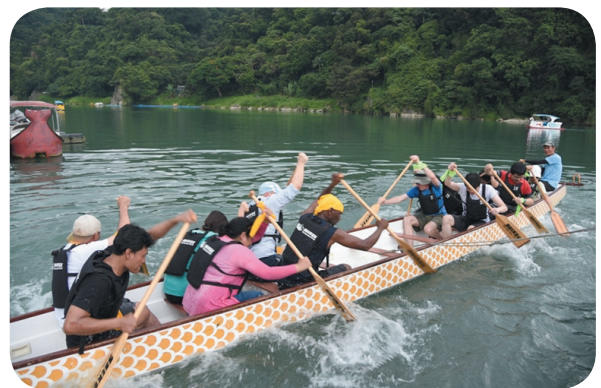
Foreign scholars participate in the exciting dragon boat racing.

The Dragon Boat Festival is one of Taiwan's most important festivals. The NCL Center for Chinese Studies put together a special event with the aim of giving the scholars an opportunity to experience Taiwanese traditional culture while fostering international scholarly exchange. The center arranged for the scholars to participate in dragon boat racing and rice dumpling wrapping activities, inviting trainers with international racing experience and festive food master chefs to host the activities by the scenic Bitan Bridge.