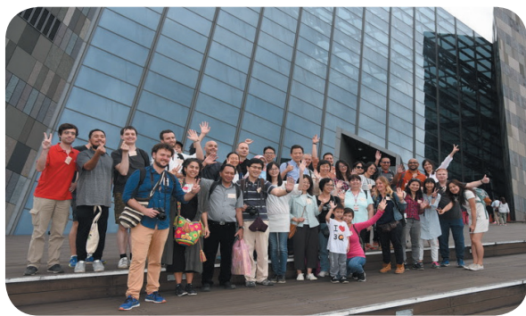
Foreign scholars visit the Lanyang Museum.

Through the carefully-designed event, scholars were able to tour the Toucheng Leisure Farm, which is known for its environmental management, and understand the sustainable development and value of Taiwan agriculture. Furthermore, they were treated to a DIY experience with kumquat vinegar and leaf printing. After the visit to the Toucheng Leisure Farm, scholars proceeded to tour the Lanyang Museum, where they could see a glimpse of Guishan Island's unique visage. This brought the activity to a perfect close.